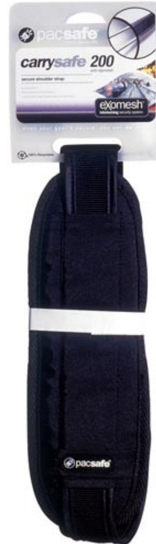
details PP hang tag. Product shot provided by client.