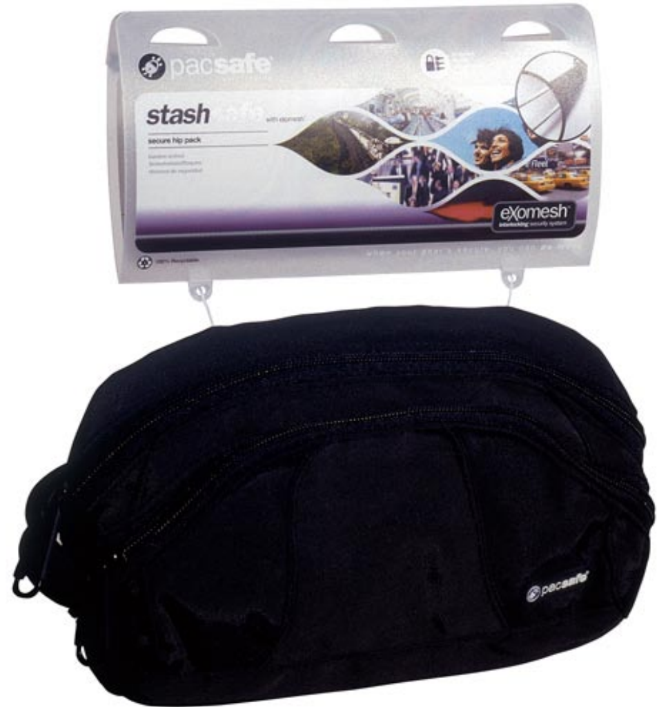
details PP hang tag.