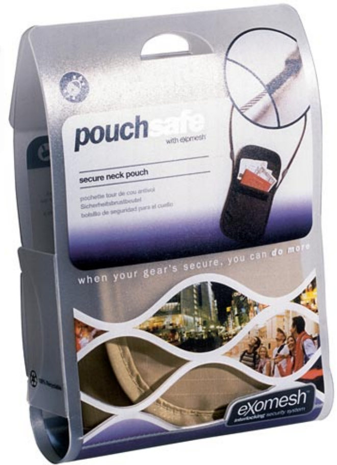
details PP wraparound holster.